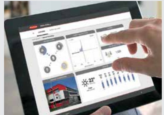
/ Simple PV system overview

/ Using a Fronius Smart Meter with Fronius Solar.web will also allow you to monitor any problems with your PV system ensuring that any issues are fixed quickly, thus limiting the downtime of your system and loss of energy production.